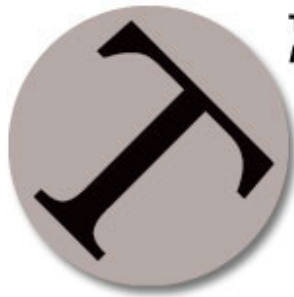
Tap symbol, Revised through Fallen Empires