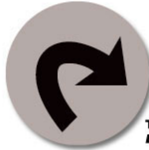
Tap symbol, Eighth Edition to present