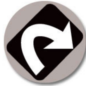
Tap symbol, Fourth Edition through Scourge